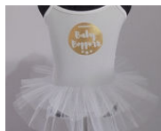
Baby Boppers Tutu $50 C2-12