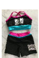
Crops $45 Shorts $45 (mid waist or High waist shorts available) C4 - AXL

Our United Dance uniform is unique, comfortable and provides a sense of belonging to our dance community and our dance family. United Dance does enforce a strict mandatory uniform policy for all its students. We believe uniforms create a sense of unity and discipline as well as cutting out "brands" that not every family can afford. Our uniforms and shoes are very reasonably priced and are good quality ensuring they last for years after purchase. All items below can be ordered and purchased through the studio and your parent portal, acting as a one stop shop! All prices outlined below are inclusive of GST. (Please note- prices are subject to change if necessary with notice given).