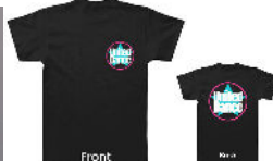
Unisex TShirt $40 C4-AXL