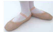
Pink Ballet Shoes $38 Black Jazz Shoes $50 Tan Tap Shoes $70