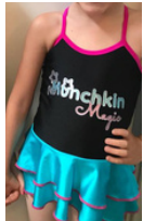
Munchkin Magic Dress $50 C2-12