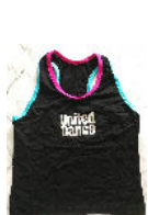
Singlet $50 C4-AXL